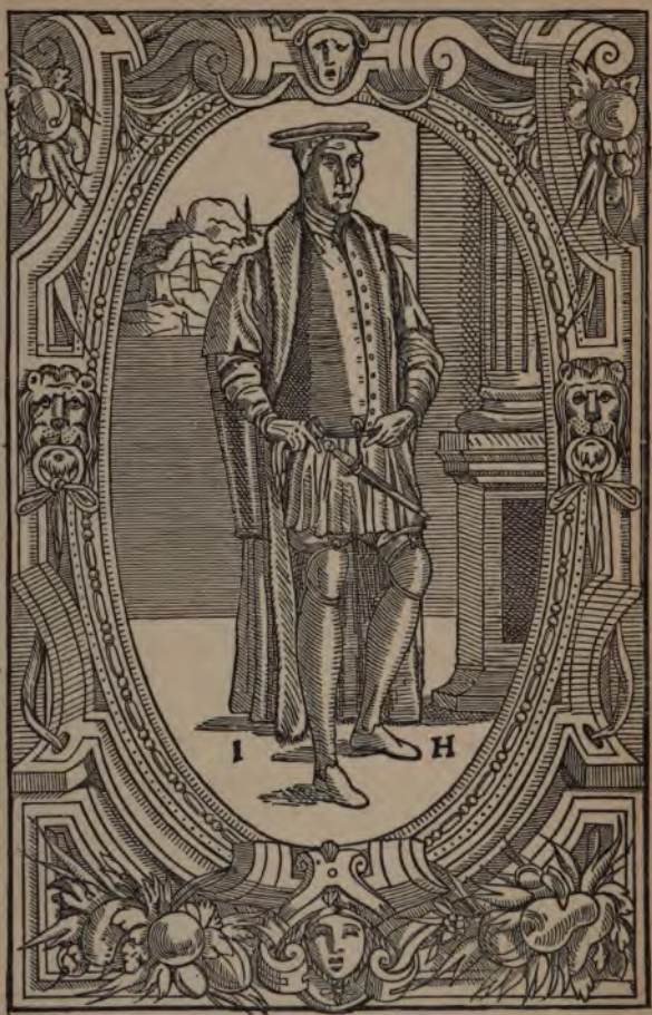
[Reduced Facsimile of Portrait of John Heywood, the Frontispiece to "Three Hundred Epigrammes upon Three Hundred Proverbs," London, 1562.]